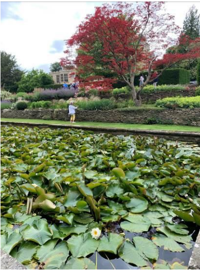
The Summerhouse Lily Pond

We welcomed over 300 visitors to the gardens and received so many comments of enjoyment not only for the chance to see the gardens but also to sit over a cup of tea and a piece of homemade cake at Hunters Lodge.